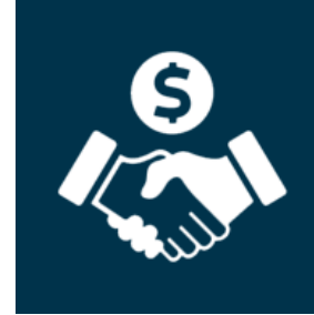
Daily Pricing NAV Calculation