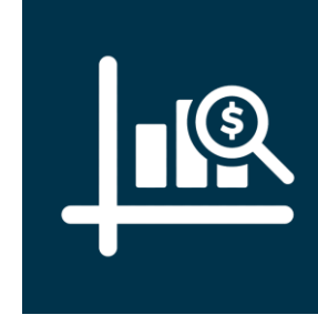
Valuation of Options JV Interests