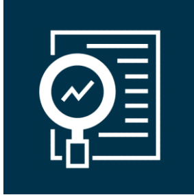
Appraisal and Appraisal Review