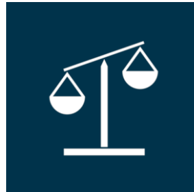
Process Implementation for Internal Valuations and Asset Management