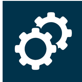
Process implementation for Internal Valuations and Asset Management