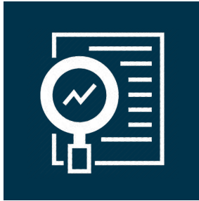
Appraisal and Appraisal Review